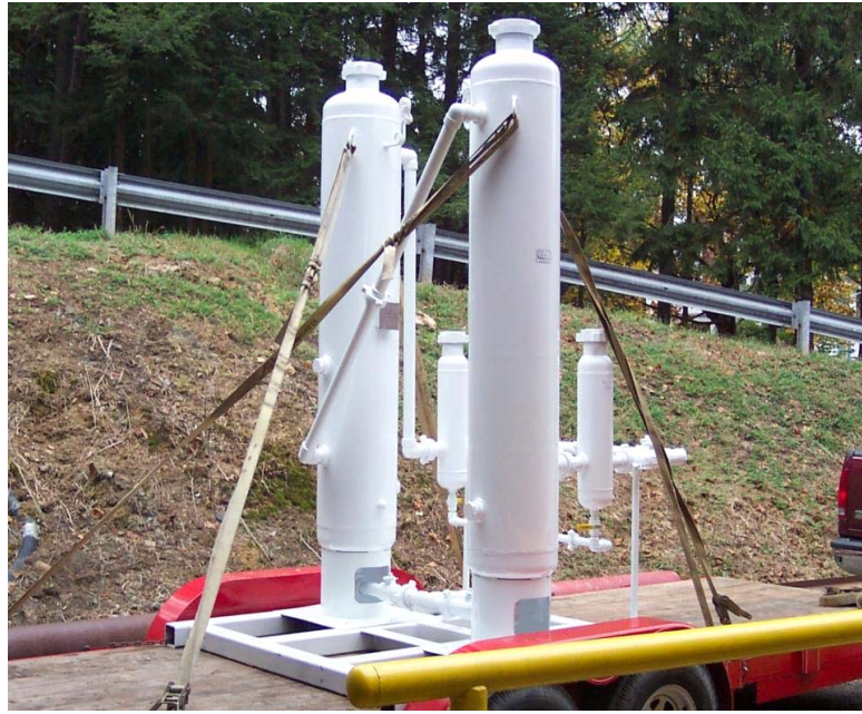
ESP Desiccant Skid being transported