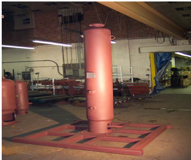
ESP Desiccant tank on skid many sizes are available