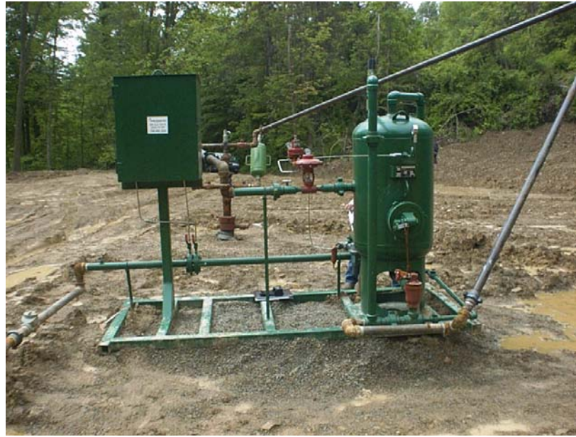
ESP Production Skid in the field