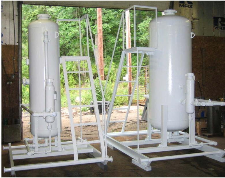
Multiple ESP Production Skids