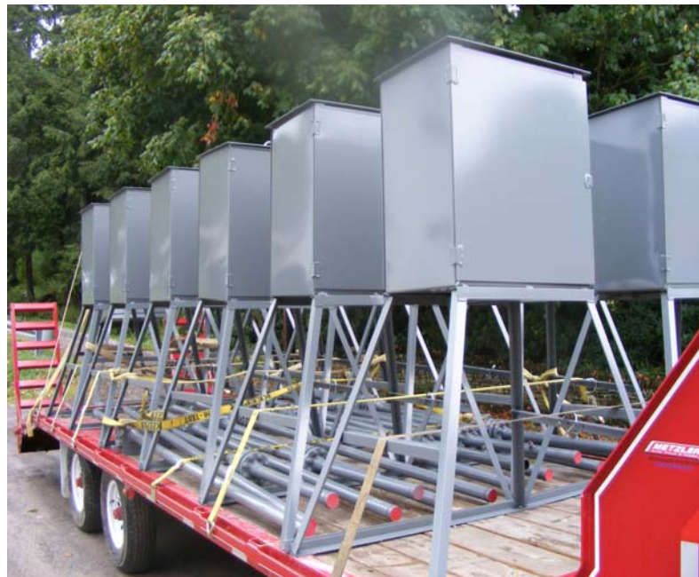
Meter huts with Simplex flange meter tubes