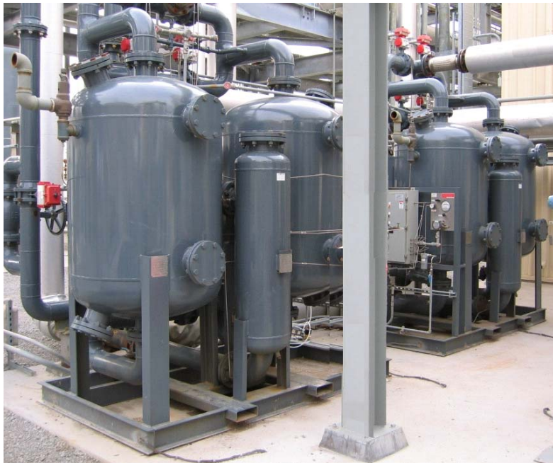
2 Large PSA Desiccant gas dryers for pipeline quality gas meeting -20 F dew point