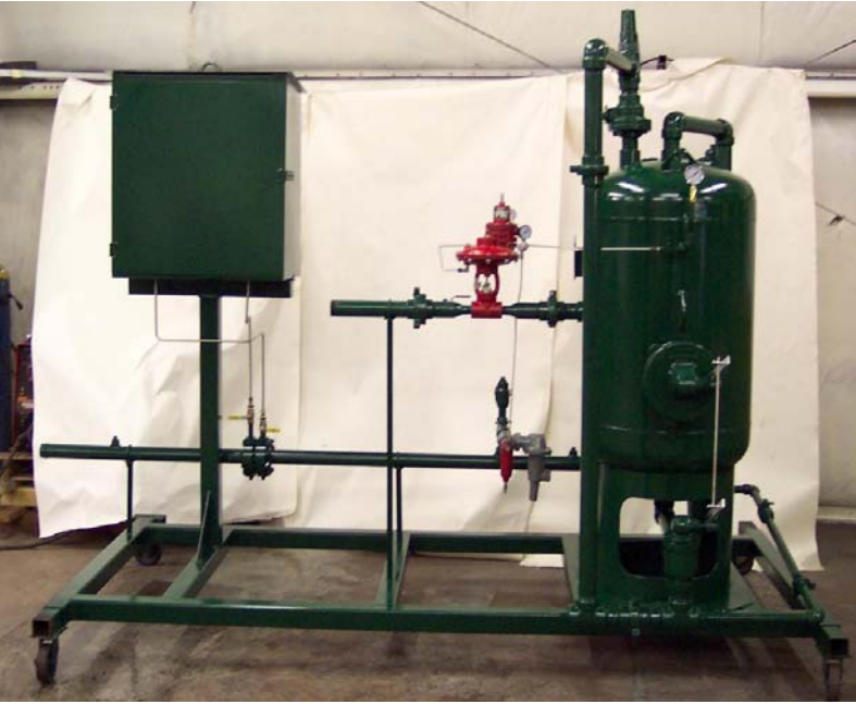
ESP Production Skid