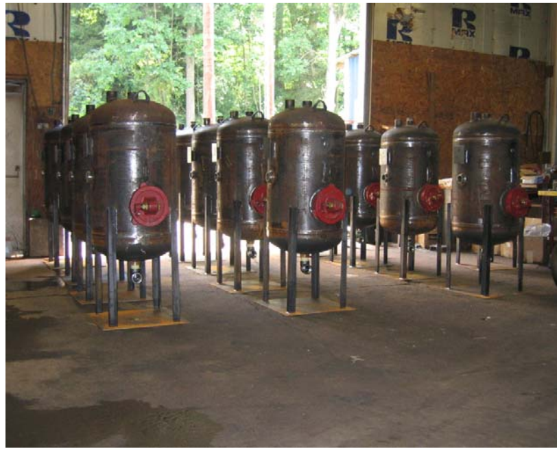
Gas Separators being staged for painting