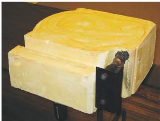
Heat exchangers are foamed for optimal performance