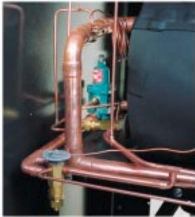
Refrigerant controls on models D-1250 & larger