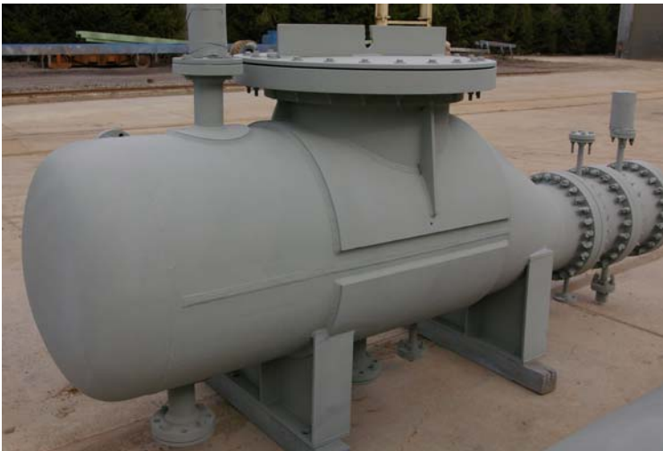
TEMA type BKU; Shell Side: 500psi/400F, Tube Side: 400psi/400F, Double T/S's, Shell inlet designed to support 10,000lbs, Vacuum dried to a dew point of -20F & then purged w/Nitrogen to 3-5psi for shipment/storage.