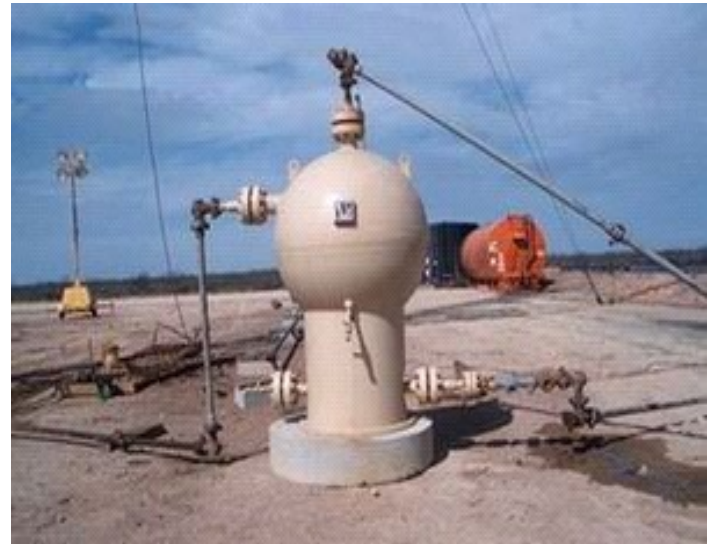
5000 psig Super Sand Hog at well site

Patented design U.S. Patent No. 7,785,400B1 Two deflection areas and spherical design maximizes efficiency of vessel use in the 90% range.