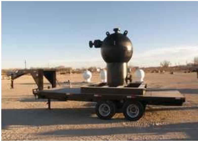
Mobile Super Sand Hog for flow-back service