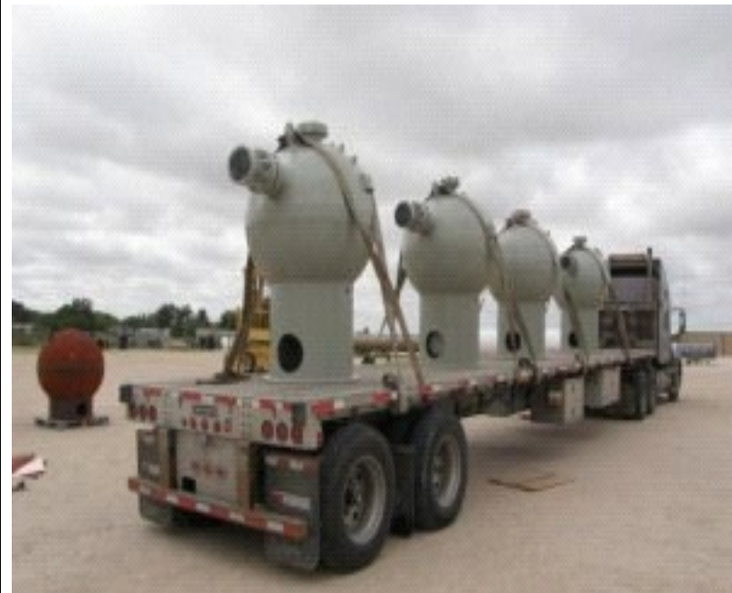
Multiple Super Sand Hogs being shipped