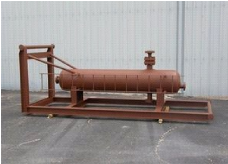
20" Sand Traps—5000 psig