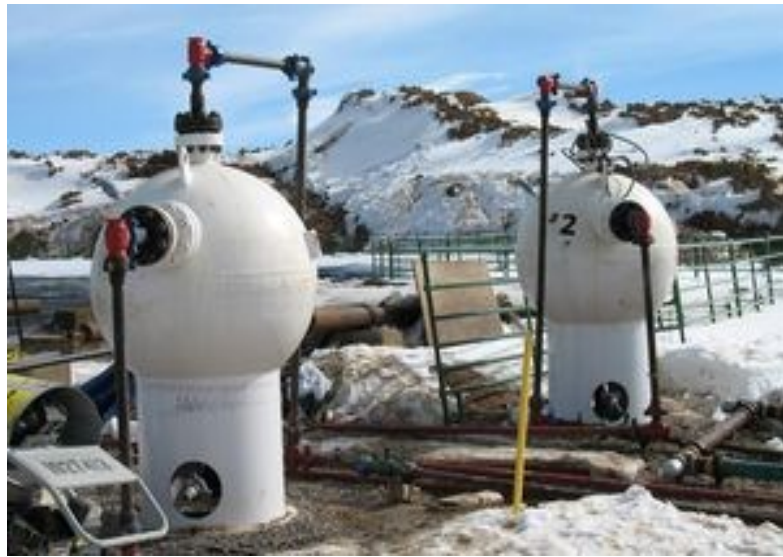
Super Sand hogs on site