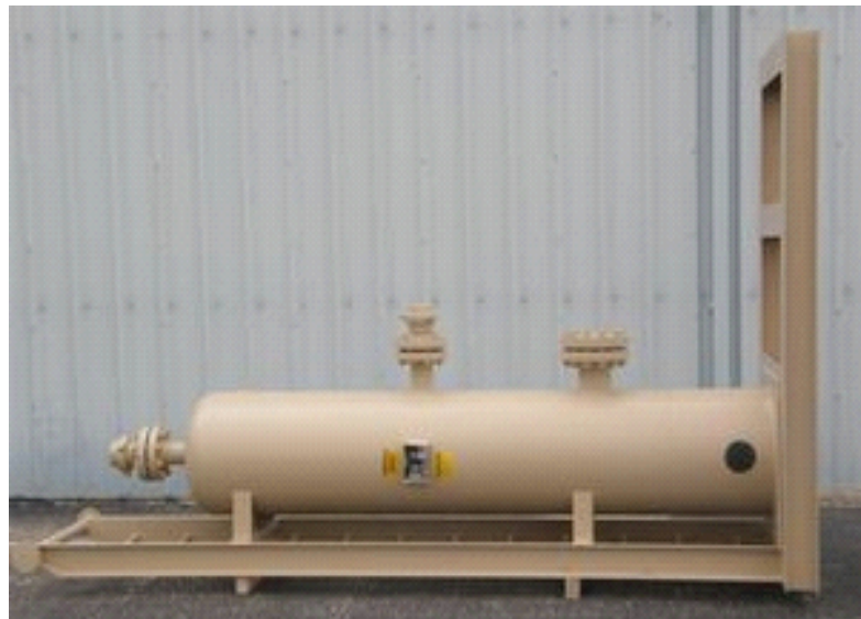
24" Sand Trap—6000 psig